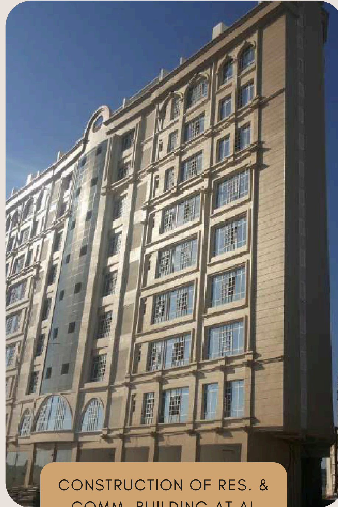
CONSTRUCTION OF RES. & COMM. BUILDING AT AL KHOUD PL NO: 266