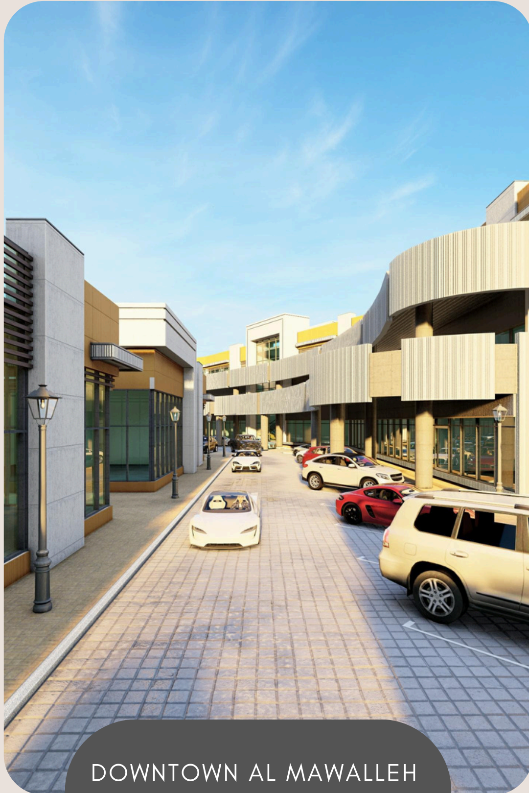
DOWNTOWN AL MAWALLEH 250 SHOP