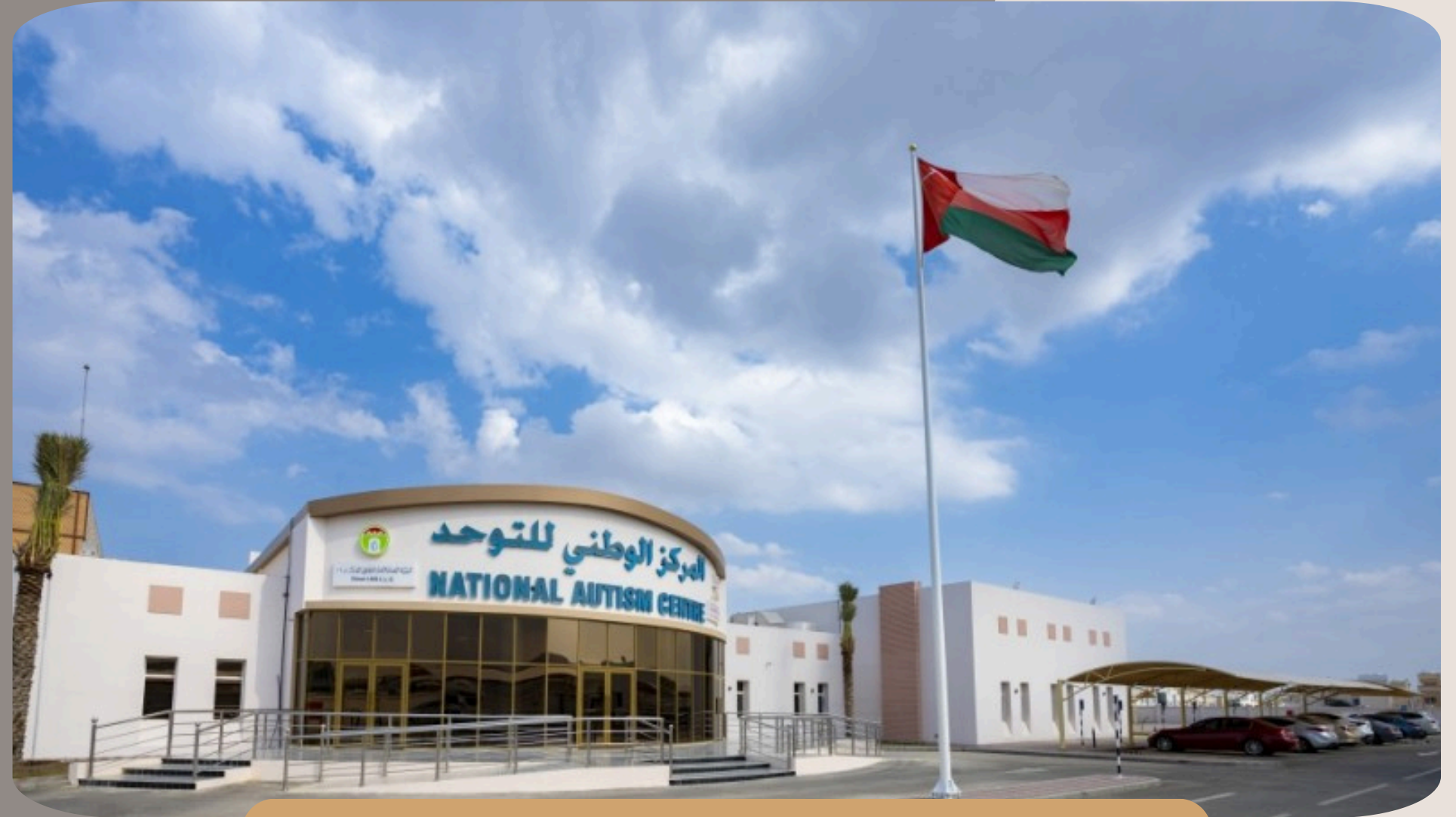
CONSTRUCTION OF AL KHOUD AUTISTIC CENTRE