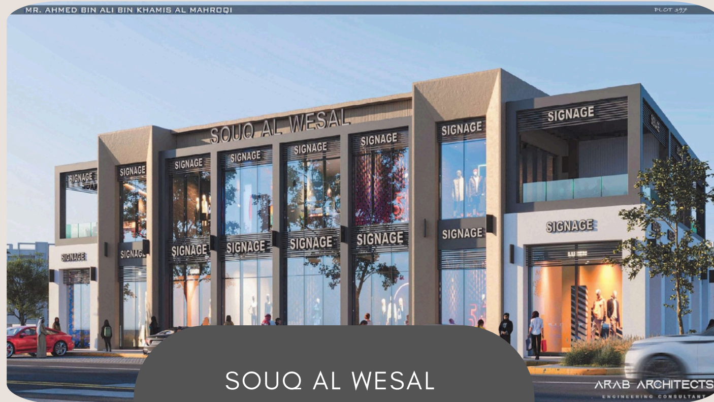
SOUQ AL WESAL 50 SHOP