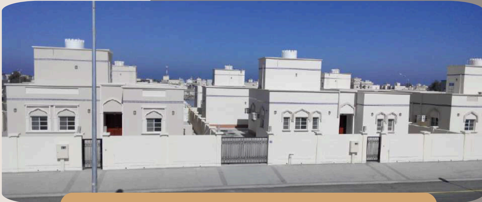
CONSTRUCTION OF 39 HOUSING UNITS AT BARKA, MINISTRY OF HOUSING