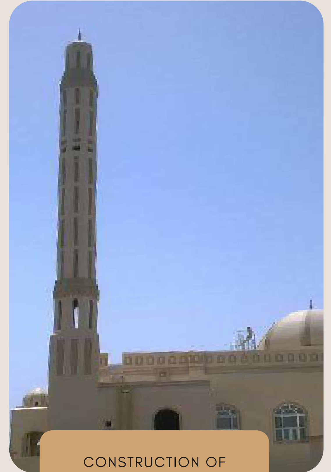
CONSTRUCTION OF MULADHA MOSQUE