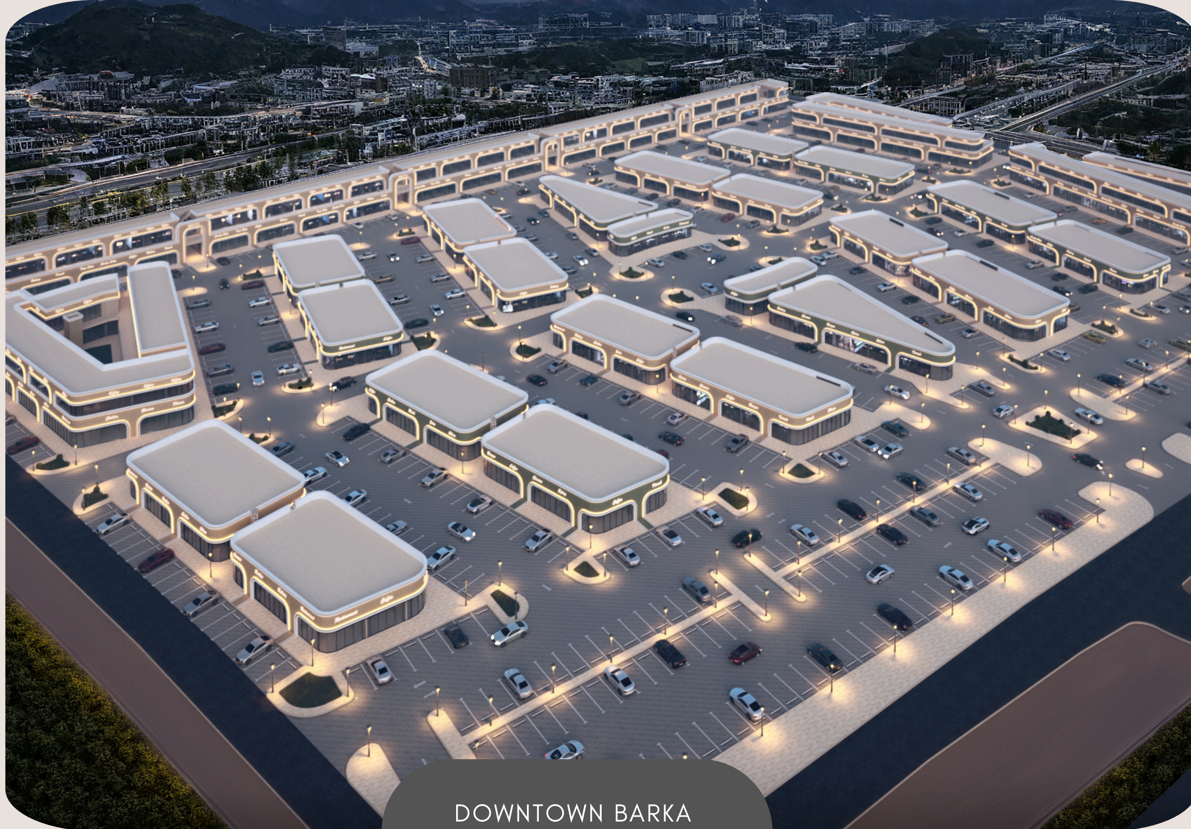
DOWNTOWN BARKA 500 SHOP