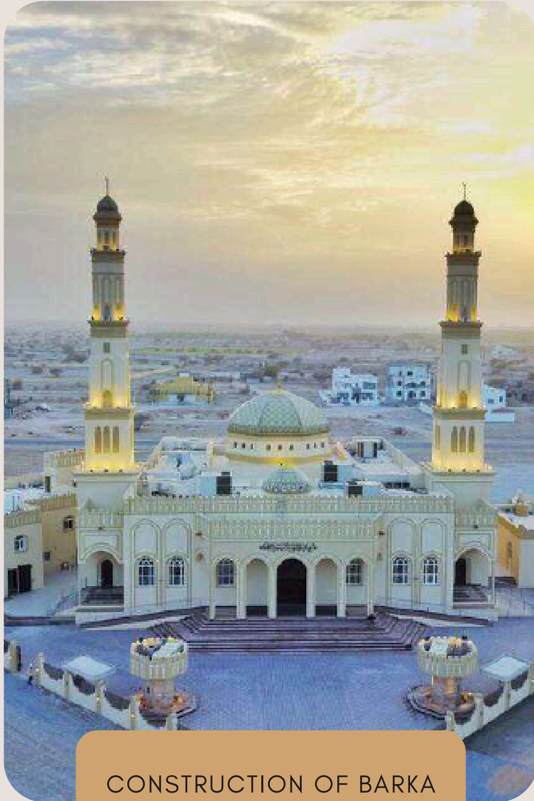
CONSTRUCTION OF BARKA MOSQUE