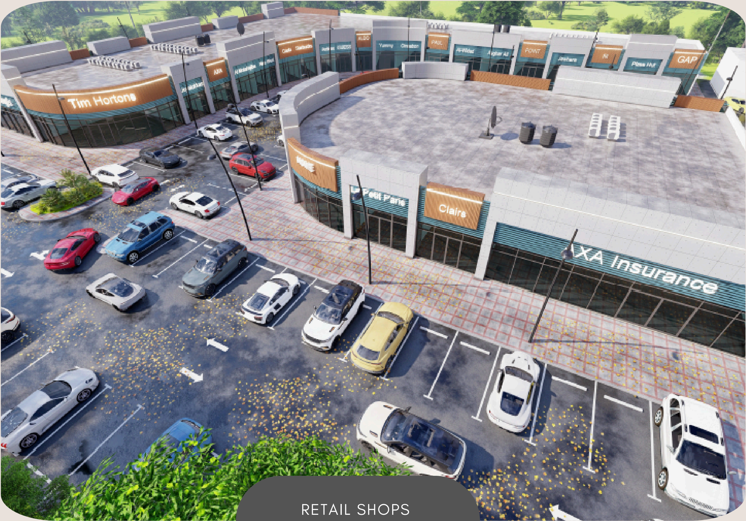
RETAIL SHOPS AL MAWLLEH SOUTH